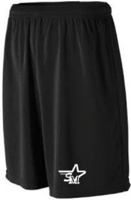
UNISEX SHORTS SIZING S UP TO 3XL