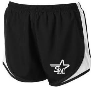
LADIES SHORTS WITH LOGO SIZING FROM XS UP TO 4XL